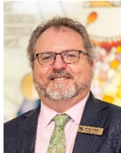
Assistant Principal Teaching and Learning