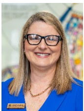
Assistant Principal Staffing