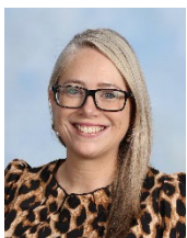
Assistant Principal Student Wellbeing (Acting)