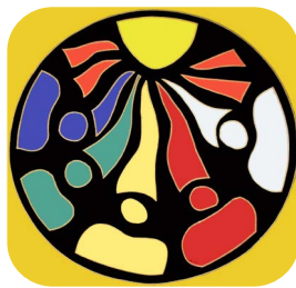
IRIN IRIN Strength West