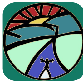
GARIWANG Wonder East