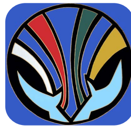
DULLUGAL Acceptance North