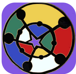
PINDARI Wisdom High

Each school day begins with Pastoral Class, when students, meet their Pastoral Leader for prayer, roll call, information sharing and discussion. Pastoral Classes consist of about 20 students from the same year group and House.