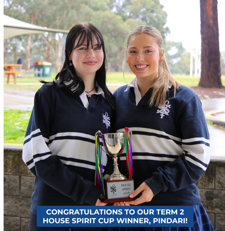
CONGRATULATIONS TO OUR TERM 2 HOUSE SPIRIT CUP WINNER, PINDARI!