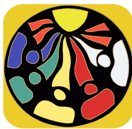
IRIN IRIN Strength West