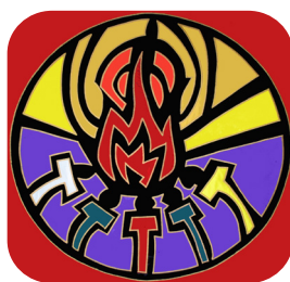
KOORILLA Passion South