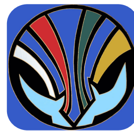
DULLUGAL Acceptance North