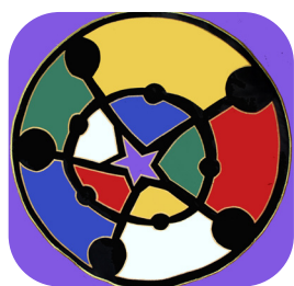
PINDARI Wisdom High

Each school day begins with Pastoral Class, when students, meet their Pastoral Leader for prayer, roll call, information sharing and discussion. Pastoral Classes consist of about 20 students from the same year group and House.